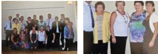
Debra Peacock-Shook - September 25, 2024 at 05:42 PM

“ 2 files added to the album kay and family